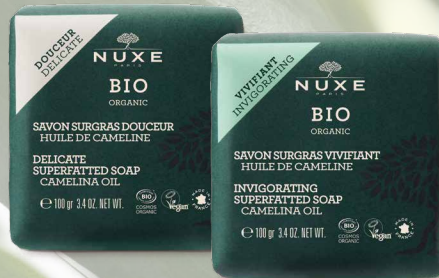
DELICATE SUPERFATTED SOAP 100 g bar: xxx INVIGORATING SUPERFATTED SOAP 100 g bar: xxx