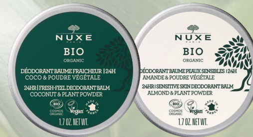
FRESH-FEEL DEODORANT BALM - 24HR 50 ml jar: xxx 24-HOUR SENSITIVE SKIN DEODORANT BALM 50 ml jar: xxx

These soap bars effectively cleanse the face and body while respecting the skin. They are made according to a traditional process by a master soap-maker in Provence. Their creamy textures enriched with Organic Camelina Oil remove traces of make-up, impurities and pollution to leave skin feeling ultra-soft. Skin is respected for 100% (11) of testers.