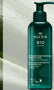
face and body BOTANICAL CLEANSING OIL 200 ml pump bottle: xxx

This rich eye balm combines Buckwheat from Brittany with natural-origin vitamin E to protect the delicate eye contour area, improve moisturizing and correct signs of fatigue. The eye contour area is smoothed for 100% (6) of testers.