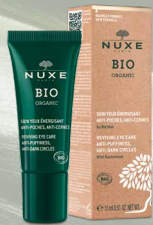
REVIVING EYE CARE ANTI-PUFFINESS 15 ml jar: xxx